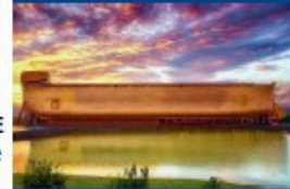
Enjoy a visit to the Famous Ark Encounter!