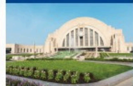
Incredible Cincinnati Museum Center, including an Omnimax Show