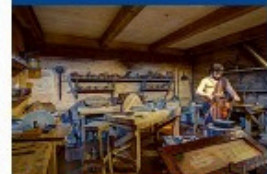
View from Inside the Ark Encounter

Day 6: Today, after enjoying a Continental Breakfast, you depart for home... a perfect time to chat with your friends about all the fun things you've done, the great sights you've seen and where your next group trip will take you!