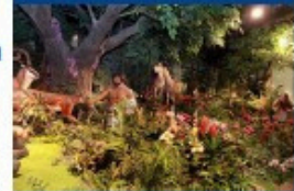
Visit to the Amazing Creation Museum!